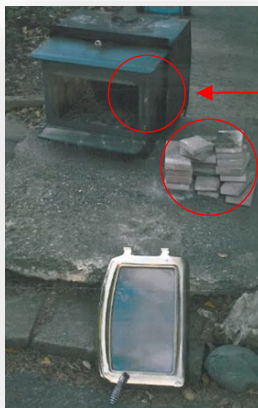
C. Front of the appliance showing that the door and firebrick were removed and that the door hinge mechanism was smashed